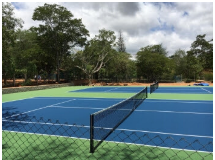
The new Tennis court