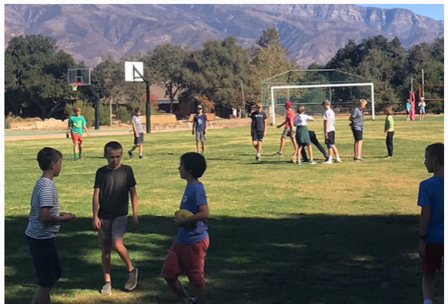
A beautiful November at Oak Grove School

The teachers also gave their best with their rendition of an old Hindi song that left everyone starstruck. Overall, the event along with a special dinner left the children bright and happy for the night ahead.